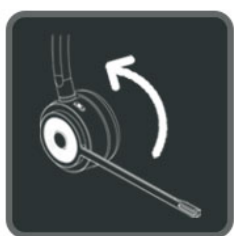
Rotatable&Flexible Mic Boom

The C110M/ C110DM are the leading budget-saver hybrid headsets ideally for office and home office use. The headsets have great noise cancellation and high quality speaker sound. The use of the soft leather cushion makes it comfortable to wear and the ergonomic design of the whole headset allows the user to enjoy wearing with good feelings. It is stylish and professional design. Call center or contact center users, office worker users, home-work users can take advantage of the headsets good noise cancellation and high quality audio to maximize the productivity. The C110M/ C110DM is UC, MS Teams compatible as well.