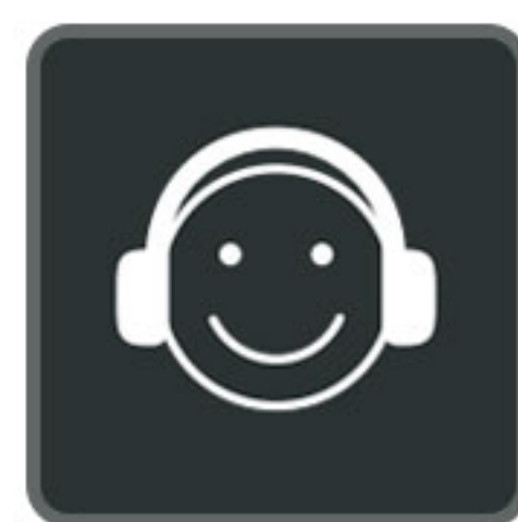
Comfortable to wear all day